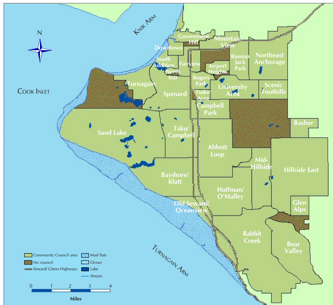
Figure 2. Anchorage